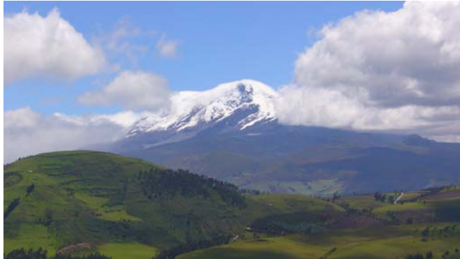
View of Imbabura Volcano